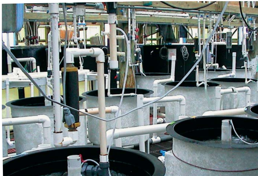
Changes to reduce bacteria levels in the research hatchery included improved system design, better management and the optimization of pipe sizes and reduction of by-passes and other regions where bacteria might accumulate.