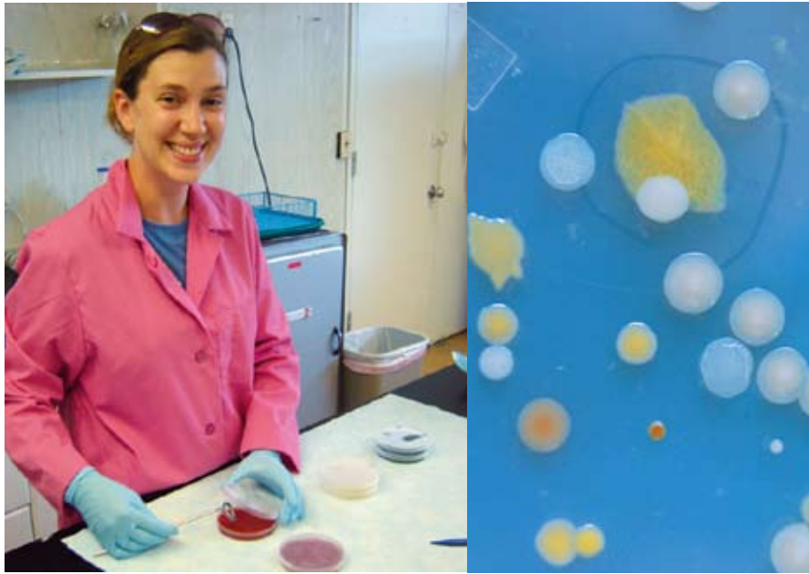
Bacterial screening of samples from various parts of the larval-rearing system led to improvements in operational protocols and system design.

impacts on hatchery operations. Initial screens showed that bacteria titers in the water supply had remarkable fluctuations from less than 100 to over 6,000 cfu/ml, despite using water from a rather constant saltwater well system.